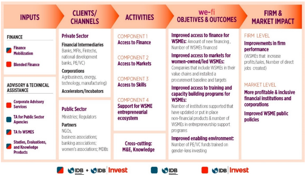
Figure 4: WeForLAC Theory of Change