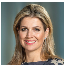
Her Majesty Queen Máxima of the Netherlands, UN Secretary-General's Special Advocate for Inclusive Finance for Development