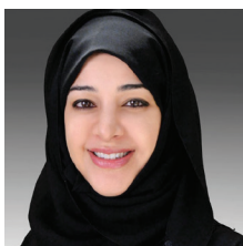
Her Excellency Reem bint Ebrahim Al Hashimy, Cabinet Member and Minister of State for International Cooperation, UAE