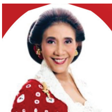
Her Excellency Susi Pudjiastuti, Minister of Marine Affairs and Fisheries, the Republic of Indonesia