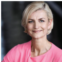
Her Excellency Ulla Tørnæs, Minister for Development Cooperation, Denmark