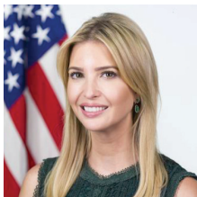
Ms. Ivanka Trump, Advisor to the President, USA