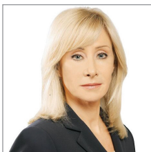
Ms. Oksana Pushkina, Deputy Vice-Chair, Committee on Family, Women and Children's issues, The State Duma, Russian Federation